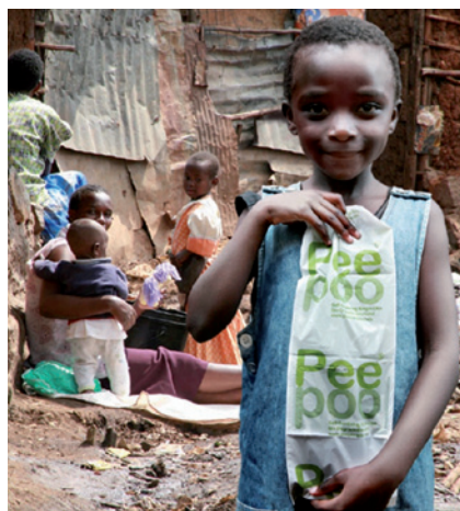
The Peepoo biodegradable bag captures human excreta and can be used as fertilizer.

Together, these measures would help to cut phosphorus-containing waste, enhancing food security while also reducing the polluting effects of phosphorus run-off. But the gaping institutional vacuum for phosphorus